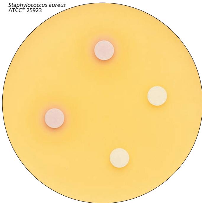
Staphylococcus aureus ATCC™ 25923